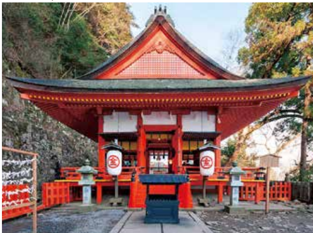
Oku-Sha (Izutama shrine)

The most solemn festival is held October 9~11, when Kami-sama (God), in a portable shrine, accompanied by the Chief Priest in an elaborate palanquin and a retinue of other shrine priests and shrine maidens, guards and footman a procession down from the Gohon-Gu (main shrine) to take up temporary residence at the shrine.