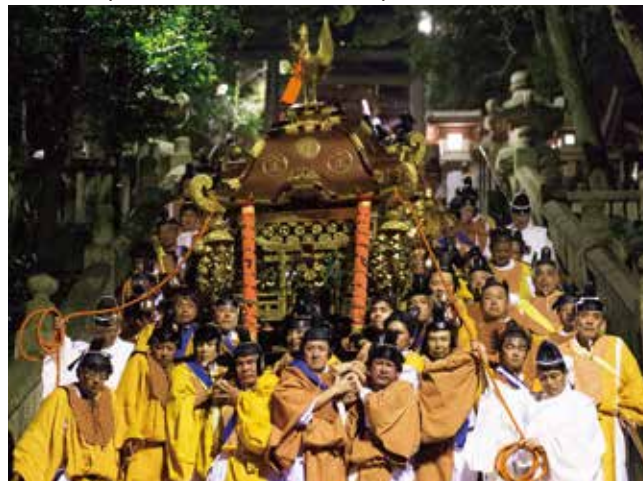
Reitaisai (The most solemn festival)

Kemari, a colorful pageant of "soccer skills" by shrine priests in colorful classic costume, can only be seen in Kyoto, or here at Kompira-san on the ground in front of Omote-Shoin. The Kemari ground is defined by four forked trees, a pine, cherry, willow and maple. Gods are said to be sitting in the forks enjoying the display. Not to be missed, kemari is on May 5, July 7,