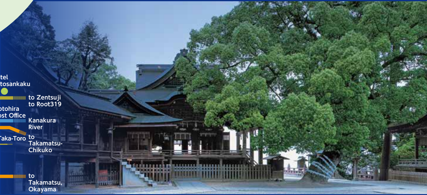
Gohon-Gu (main shrine)

The top picture is "Member of Sanuki-in, a figure to save Tametomo". A painting by Kuniyoshi Utagawa an Ukiyoe artist in late Edo period.