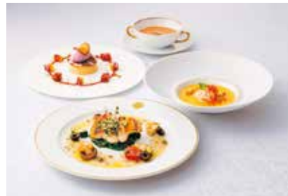
Dishes in Kamitsubaki

You'll pass the largest building on the site, Asahi-Sha, which sits on the last flat place before the steep climb up to the Gohon-Gu (main shrine).