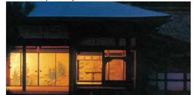
Hyakka-no-zu (open on special occasions)